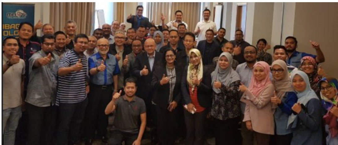
Figure 3: Participants posing with the MBOT president for a group photo session